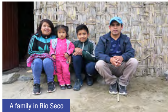
A family in Rio Seco

On August 15, we were invited to the inauguration of the Aussaprub association's office, which manages the water supply of ten rural villages in Barranca. The leaders were very proud to have built these premises with the association's very funds. What a good example of autonomy!