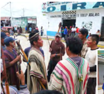
Protest in Atalaya

Hundreds of indigenous people from the province came to Atalaya for the big rally organized by the leaders of their associations, OIRA, AIDESA and others. Their demands covered a dozen points, related among other things to the pollution of rivers, the concessions authorized by the central government to logging companies, and so on. They demanded the arrival of Prime Minister Villanueva. Since the protesters blocked the rivers and roads, we could not leave Atalaya to go to Diamante Azul and