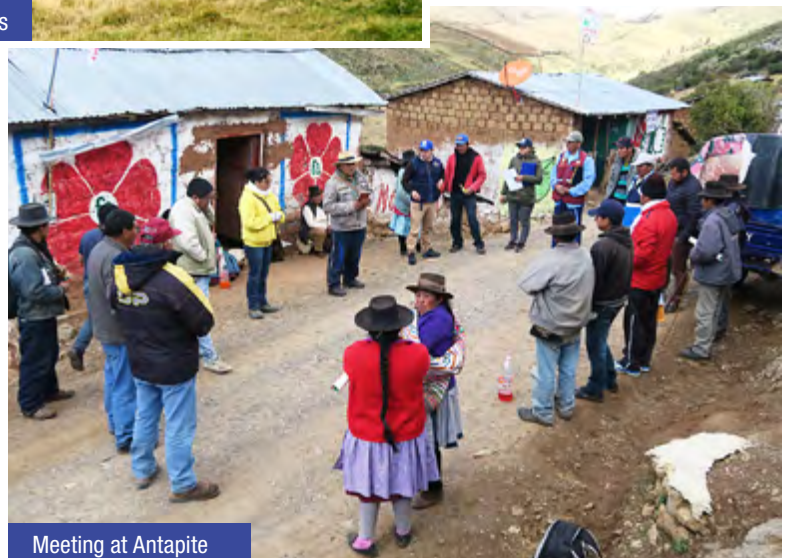
Meeting at Antapite