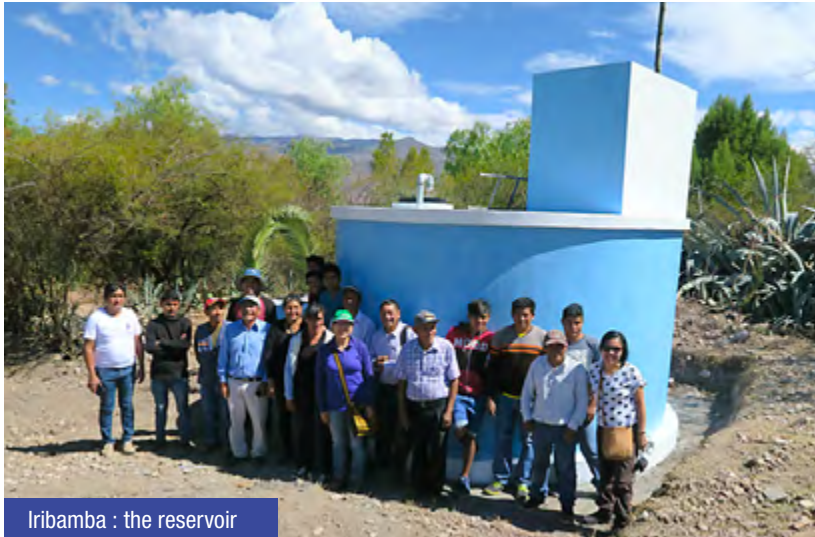
Iribamba : the reservoir

Iribamba, Huanta, August 5. We were inaugurating a major project: the trenches dug for the pipes were more than 10 km long. The pride of the Iribamba farmers who worked hard to complete the project could be seen in their eyes. It also had a ripple effect, since the neighbouring village of Azángaro seemed ready to repeat Iribamba's community work effort in order to also gain permanent access to drinking water.