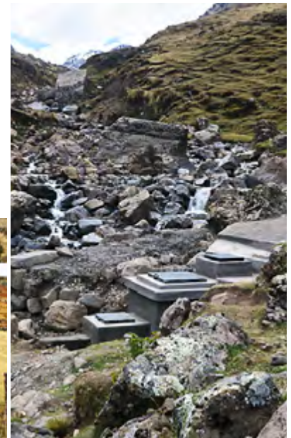
Antallaqta : the source at 4002 m

On August 10, we visited the community of Waripercca, where the drinking water project was inaugurated on April 23. The ecological toilet construction phase is currently in progress. We finished our tour in the Andes in Angasmayo and Mitapasamana. The water and sanitation projects of these two communities will be carried out in partnership with the ISW (International Secretariat for Water).