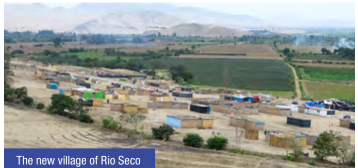
The new village of Rio Seco