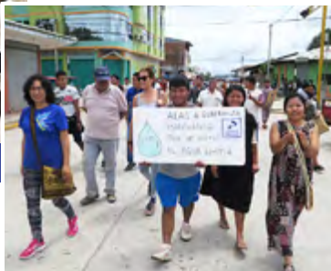
We march for water

Shinipo. On the 22 nd , we took part in a long march on the streets of Atalaya with the students of Centro Nopoki. At the end of the day, a central government commission arrived as part of an emergency plan and confirmed the arrival of Prime Minister Villanueva on August 28.