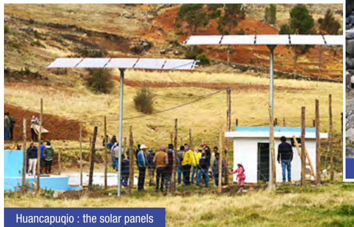
Huancapuquio : the solar panels

Huancapuquio, Vilcas Huamán, August 6. It was our first time installing a solar-powered pumping system in the Andes. The system had already been in operation for two months and the results exceeded our expectations. The experiment is conclusive and the skeptics were proven wrong.