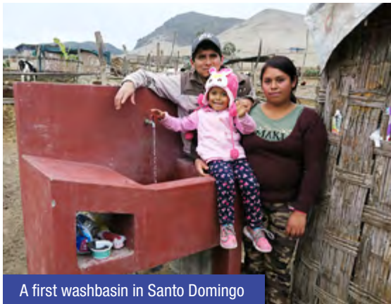
A first washbasin in Santo Domingo