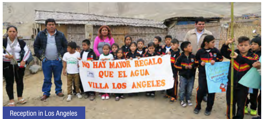
Reception in Los Angeles