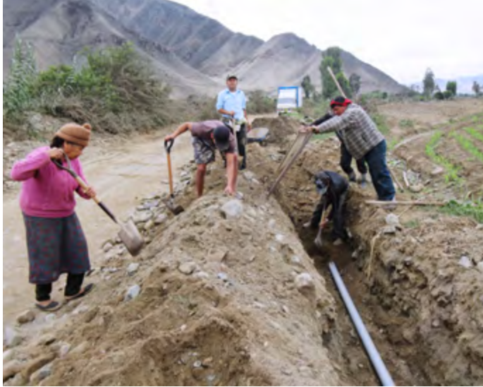
The entire community took part in the reconstruction of the water main.

Thank you so much for supporting them through your donations.