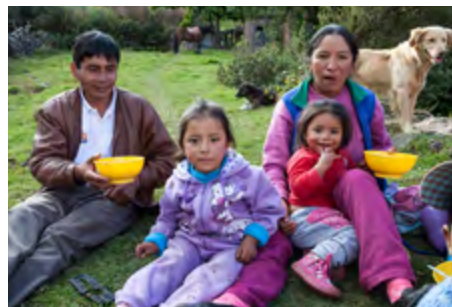
Thanks to clean running water, this Manzanayoc family has a more promising future.

The community, which is nestled in the heart of the Andes, is particularly disadvantaged because it is very far from major centers and without adequate roads to promote trade.