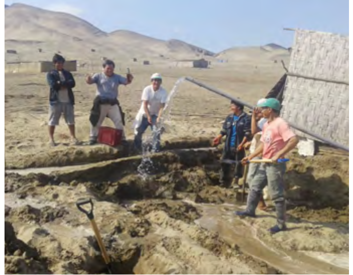
Water arriving in the new village.