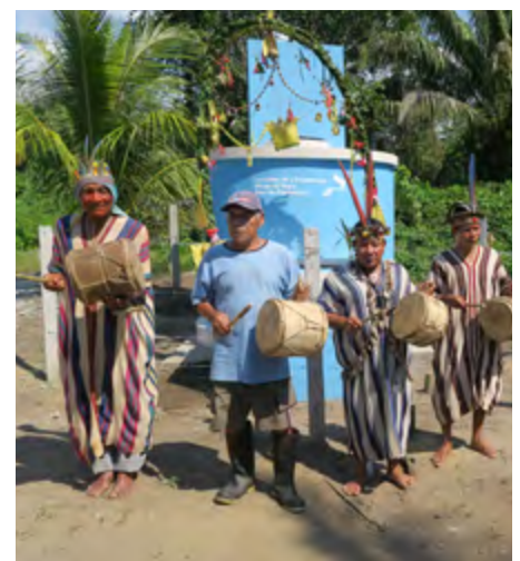
Ashéninkas played music all day long

These three communities had joined forces to prepare for a great celebration of water . Pride was palpable among the natives, the fruit of the enormous task that they had accomplished. Indeed, the length of the gravity induced water main exceeds 10 km from the site of capture, which was built in a remote and not easily accessible location. This project, built by and for the communities of Cascada Unini, Diamante Azul and José Olaya, is a true example of sustainable community water management . We thank you for your support.