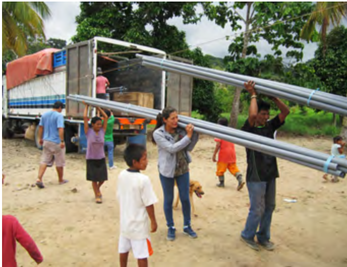
The arrival of the pipes, as here in Canuja: a very happy moment!