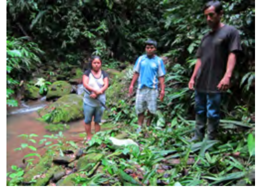
The water catchment site