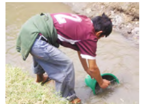
Millions of people still draw their water from unsanitary canals or ponds