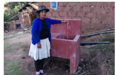
Running water at home!