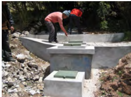
Capture of the main source

There is still a large part of the sinks to be built, but all families will have running water at home by the end of April.