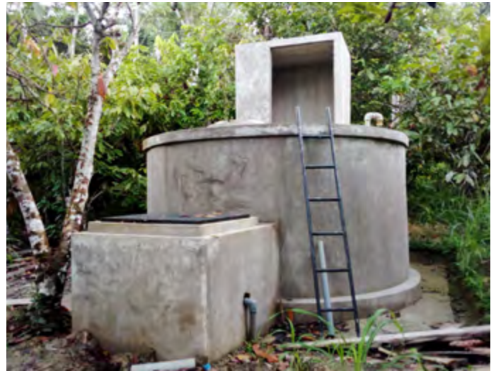
The Canuja reservoir will be painted as soon as the rains stop