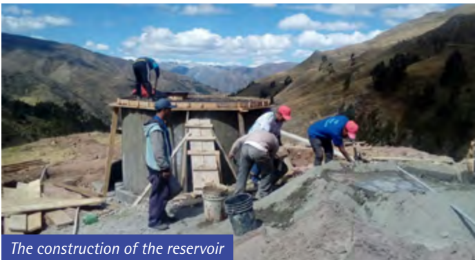
The construction of the reservoir

The same scene was repeated on the site of the reservoir located on top of the hill overlooking the village. Digging the trench in which the main water line is installed was a Herculean task, with nearly 3 km of rocky soil to gouge out. You can imagine the great satisfaction felt by the villagers after accomplishing such a feat.