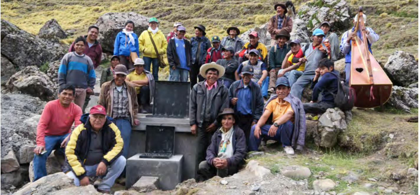
The catchment structure at more than 4000 m