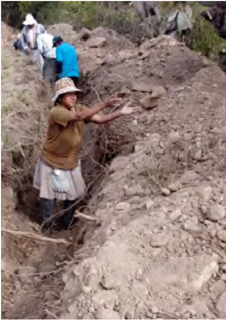
Women are not afraid of hard work