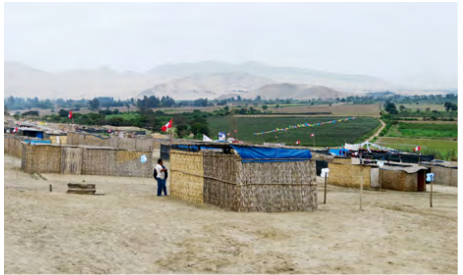
Braided bamboo huts

Work is continuing in these two localities of Distrito de Supe, Barranca , which suffered severe damage during the March 2017 floods. The gravity-based water supply system is already in operation in