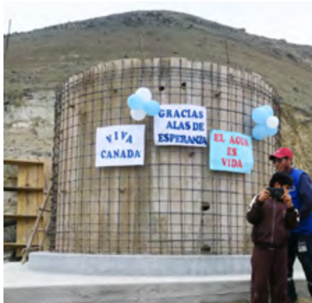
An identical reservoir will be built in Canuja