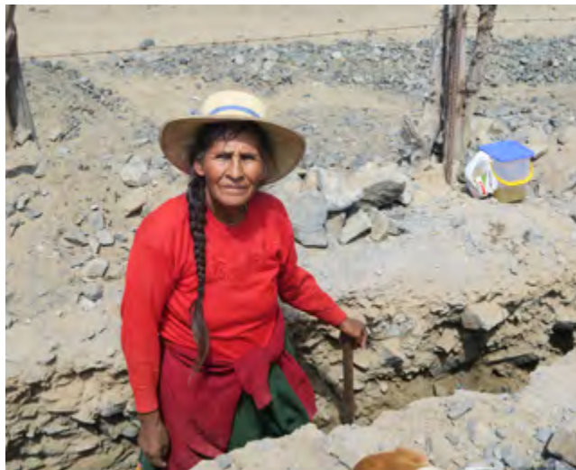
◀ A peasant woman participating in the community effort