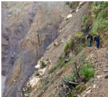
The huge crater caused by the rains

Last November, torrential rains caused a huge landslide that washed away the water catchment structure that had been supplying the village of Occochiura since 2007. We responded to the distress call issued by the Mayor of the District of Independencia. To restore service, Engineer William proposed to collect water from a more distant source and have the water pipe suspended above the huge crater.