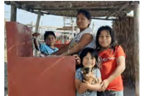
A young mother happy with her washbasin