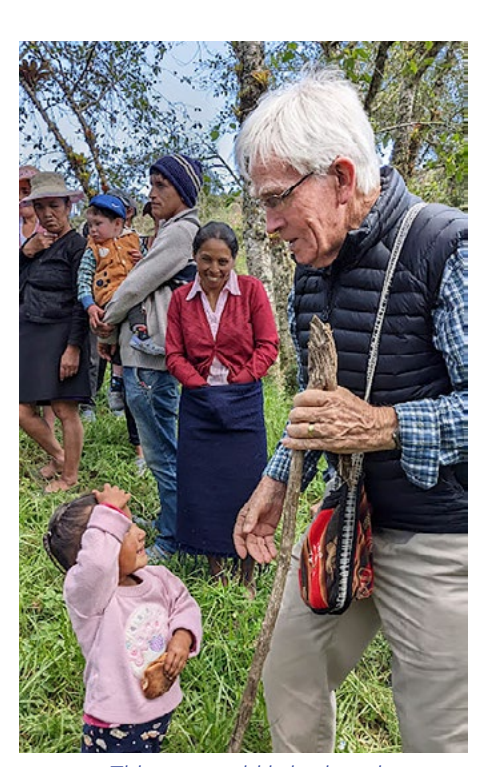
This young girl is intrigued by my white hair