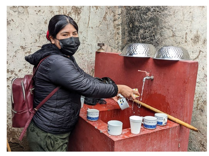
This peasant woman from Huaralica enjoys having running water