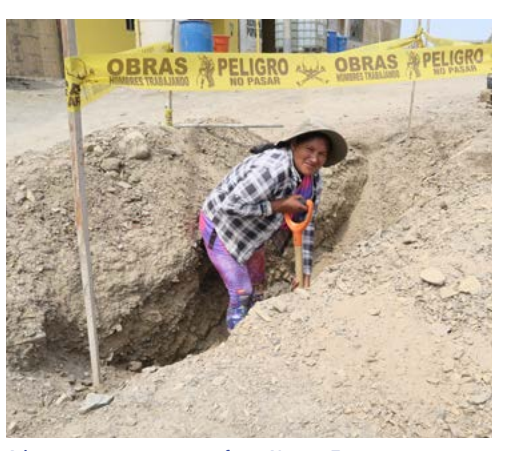
A brave peasant woman from Nueva Esperanza