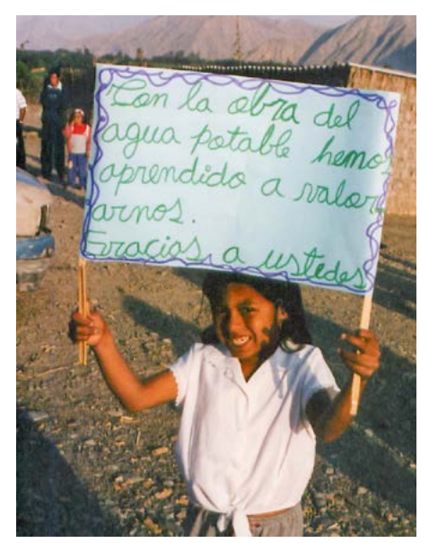
With the drinking water project, we learned to value ourselves

The hummingbird on the poster is inspired by a Quechua legend that tells the story of a hummingbird that tries to put out a large forest fire by carrying water in its beak drop by drop. To the other animals who find his approach laughable, he replies, "I know that, but I'm doing my part." The hummingbird understands that it is important to act and that if everyone does their part the world can change .