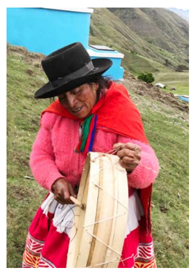
Uchuraccay Pata: welcome with carnival tunes