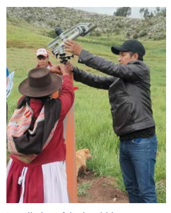
Installation of the last hidrante (sprinkler) in Putacca. This irrigation system realized in partnership with the Provincial Municipality of Vilcashuamán covers 60 hectares